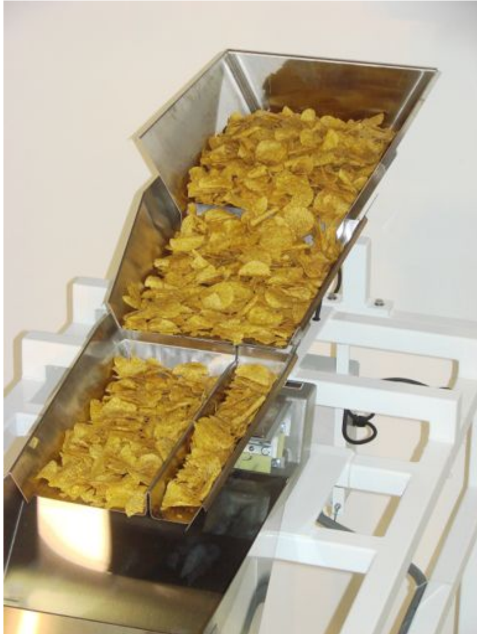
Top View of vibratory pans

Scale is designed with large vibratory pan to receive product from an infeed conveyor ensuring a controlled metered flow of product to the scale.