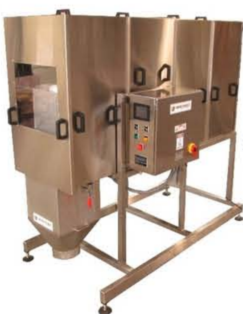
BDC-3601-STP shown with Multi-Panel Dusthood

For customer's bulk packaging 5-100 lbs. of difficult products that are moist / sticky or light and fluffy our new BDC-3601-STP will provide them a scale that can deliver the product to the weigh bucket and ensure a clean discharge into a bag or box.