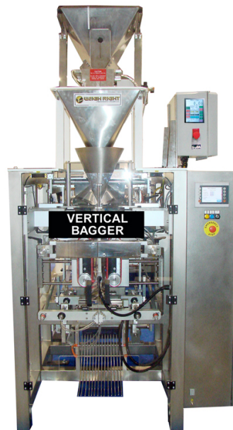
Figure 2 iQ-FLiP showing scale mounted to top of VFFS (adds about 4' in height).

Call Weigh Right for more information: 800-571-0249