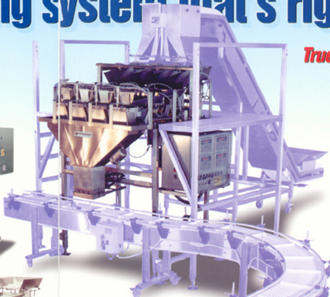
PMB-4 FULLY-AUTOMATIC NET WEIGH FILLER With optional mezzanine, infeed conveyor and container indexing conveyor shown in blue