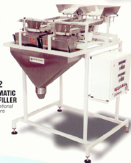
PMB-2 SEMI-AUTOMATIC NET WEIGH FILLER Shown with optional transfer pans