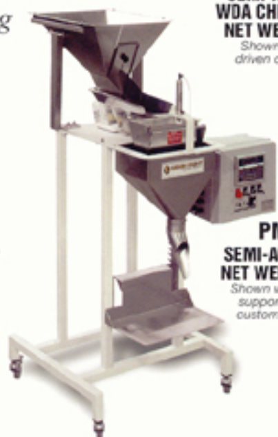
PMB-1 SEMI-AUTOMATIC NET WEIGH FILLER Shown with optional support shelf and custom bag spout

Choose Weigh Right and weigh your options right!