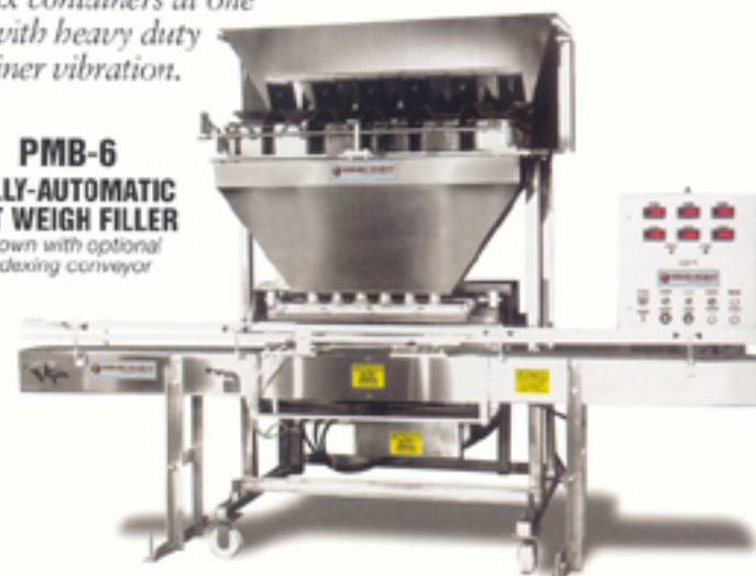
PMB-6 FULLY-AUTOMATIC NET WEIGH FILLER Shown with optional indexing conveyor

Fills six containers at one time with heavy duty container vibration.