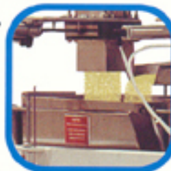
PMB-2FL Shown with optional gravity feed system

Adding this system can increase production by as much as 50%, dispensing the bulk of your free flowing product directly into the weigh bucket. When the target weight is close, the FL gate closes and the vibratory feed accurately completes the fill.