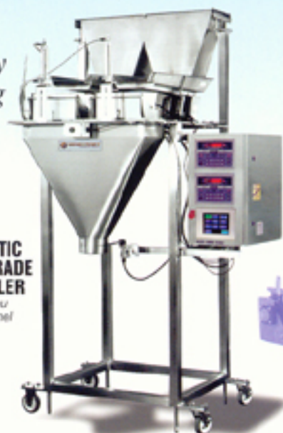
PMB-2 SEMI-AUTOMATIC WDA CHEESE GRADE NET WEIGH FILLER Shown with menu driven control panel